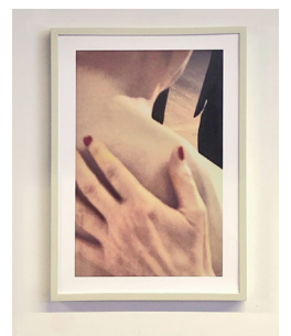
Selfportrait (HOW TO GET COMFORTABLE IN AN UNCOMFORTABLE WORLD No. 3), 2022, ultrachrome print, 62 x 44 cm, Courtesy the artist and Galerie Urs Meile, Beijing-Lucerne