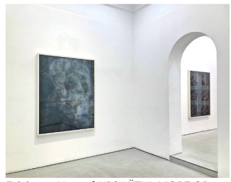
Exhibition View of URS LÜTHI. MORE OR LESS at Aural Madrid, 2022, Courtesy the artist and Aural Madrid